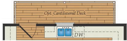
OPT. CANTILEVERED DECK