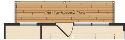
OPT. CANTILEVERED DECK W/ MIDDLE KITCHEN LAYOUT